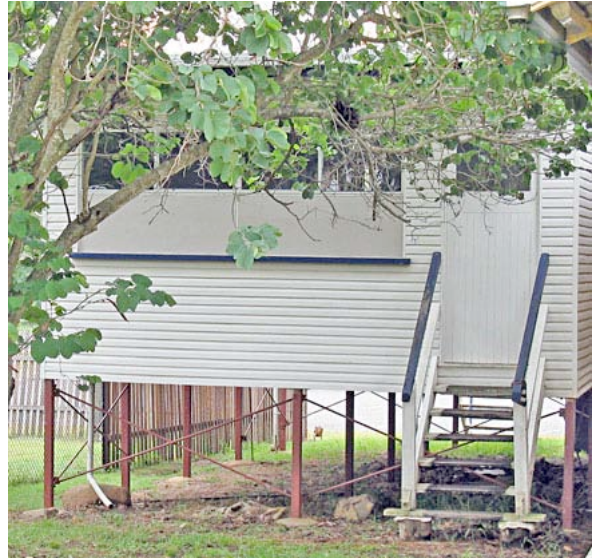
Rear view showing door offset from centre. The site slopes from the back to the front, thus the back stairs are lower than the front.