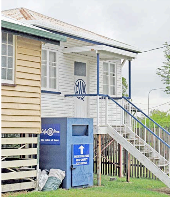
Front 3/4 views (above and below) showing small roof over entry, main hip roof, stumping and stairs. Originally the building likely had timber stumps and may have been closer to the ground.

The building is now part of the community centre and has a passageway connecting it with the building next door. For scaling purposes, the front door opening is 31" x 79" (ie portion of the door that is visible, the door is likely 32" wide).