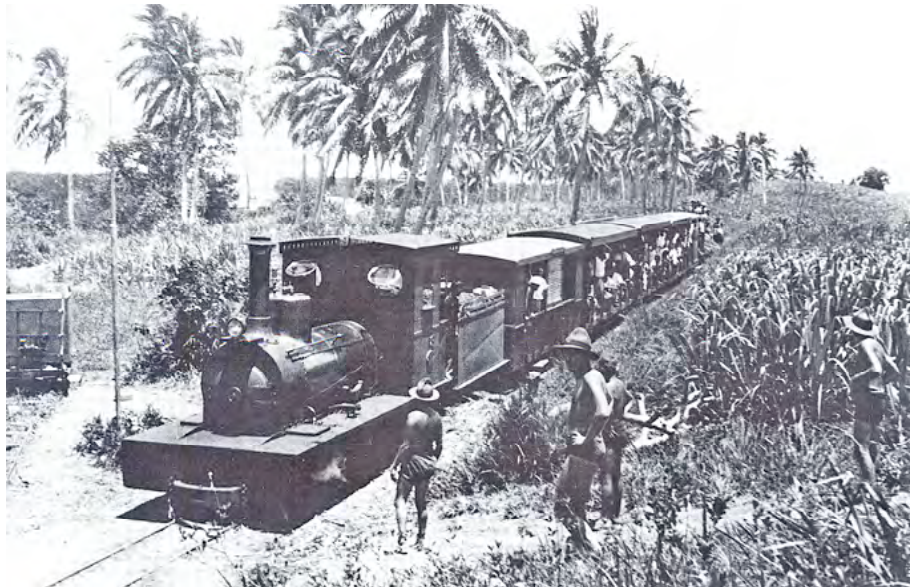
New Zealand soldiers come down to see the [Fijian] Free Train during World War Two.

While this photo was taken in Fiji, similar passenger coaches would have been used on CSR systems in Australia.