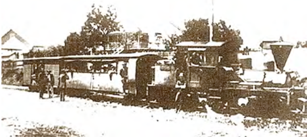
A passenger train on the Mapleton Tramway

In 1921, it is recorded that the Mapleton Tramway had two passenger carriages and 11 goods and livestock wagons. The passenger carriages were similar to those used on the Moreton Mill tramway systems and the other half was open for the carriage of cream cans and other commodities.