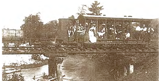
A picnic train at South Johnstone Mill in 1922

locomotive. Narrow gauge enthusiasts from the Light Railway Research Society of Australia and the Australian Narrow Gauge Railway Museum Society ran an excursion from Howard Street Yard to Dunethin Rock in more recent times. The vehicles used were ex-Mapleton Tramway flatcars fitted with new timber sleepers covered with plastic bags (to protect the passengers from splinters!) as temporary seating and a bogie navvies coach. Motive power was in the form of an EM Baldwin 0-4-0 DH.