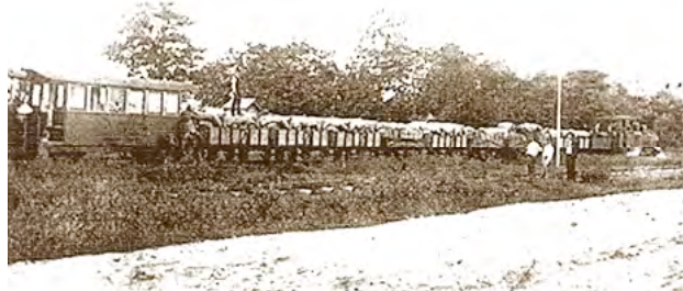
Mallet locomotive DOUGLAS on a mixed train on the Douglas Shire Tramway

There were at least two passenger cars on the Douglas Shire Tramway. One was a cross bench toast-rack style vehicle with doorways fitted with canvas blinds and a combined baggage/toast-rack coach. This latter vehicle still exists today, preserved at Port Douglas along with the Fowler, Faugh-A-Ballagh.