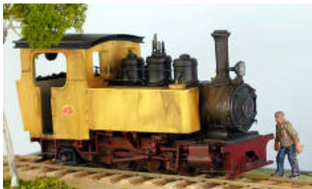
On30 model of BFC 0-6-0: kit from Hanovale Castings and Berg's, professionally assembled and painted for the 1970s era by The Model Works Australia and displayed on hand laid 16.5 mm track.

When you consider that the tramway was often the only form of local transport, and that some shire railways also carried cane, you could even include basic general freight and passenger services and still be prototypical.