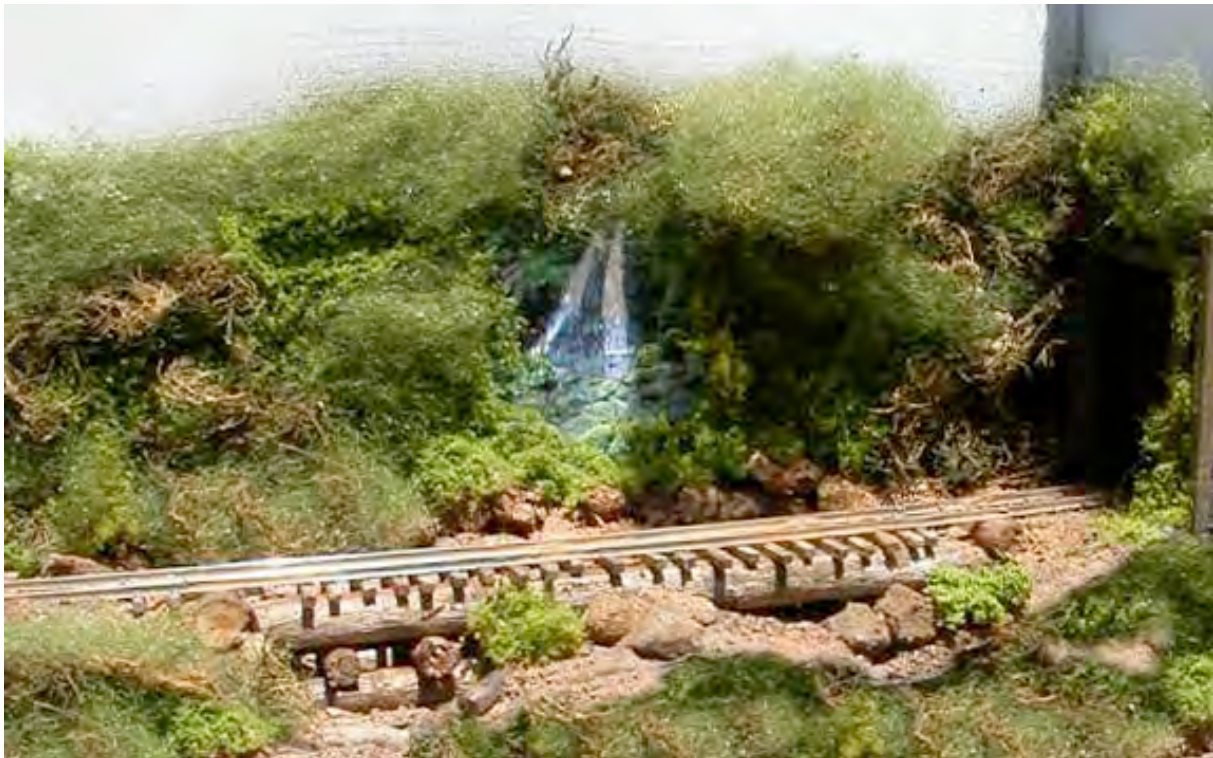
Many years later, this is how the pig sty pier trestle looked when photographed by logging researchers. Note that time has not diminished the flow of water over the waterfall ;-)