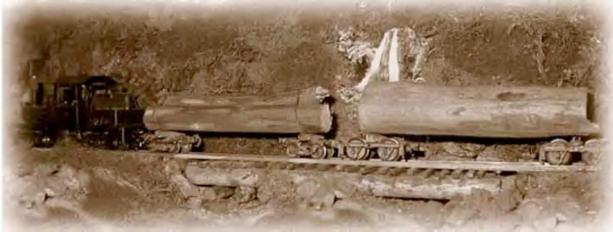
Here the Class A Shay prepares to head from Rainforest to the Cliff switchback.