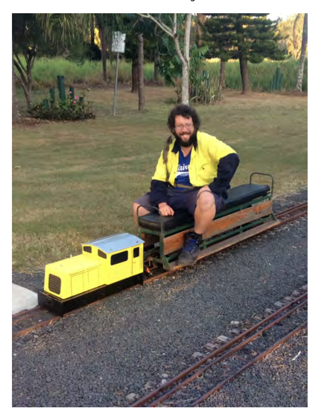
Photo of Yours Truly, taken at North Casino in late June while Lady T was on a shakedown run. I've since had a shave and a haircut, Lithgow is cold in June!

The recently overhauled drivetrain and retrofitted "cupcake tray" for ballast weight. Lady T's powerplant is a ~25cc whipper snipper engine, with a 10:18, 10:18, 10:16 gearing reduction in the drivetrain via a centrifugal clutch.