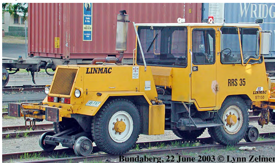
Bundaberg, 22 June 2003