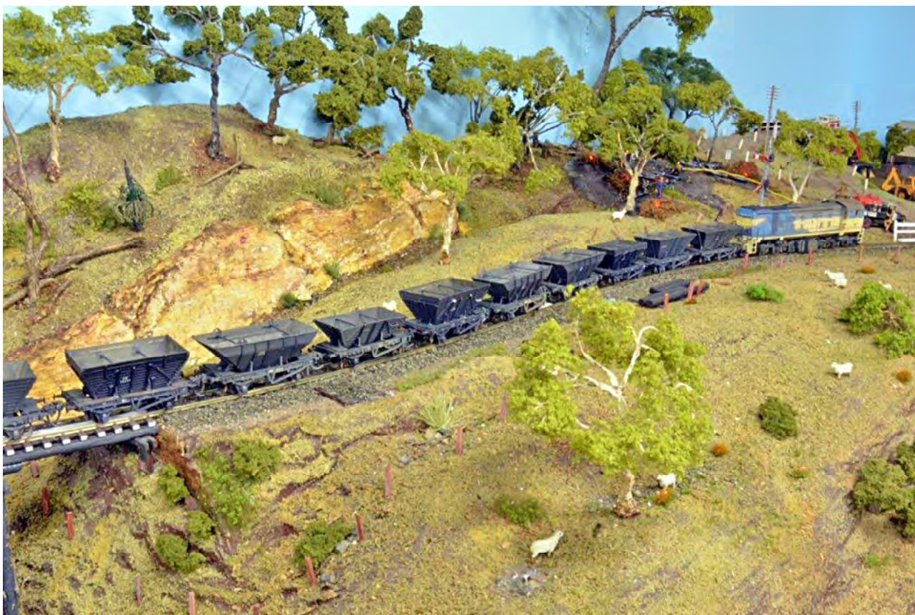
SWR train B 17 heading to the mines with empty 4w coal wagons (above) and returning loaded (below).