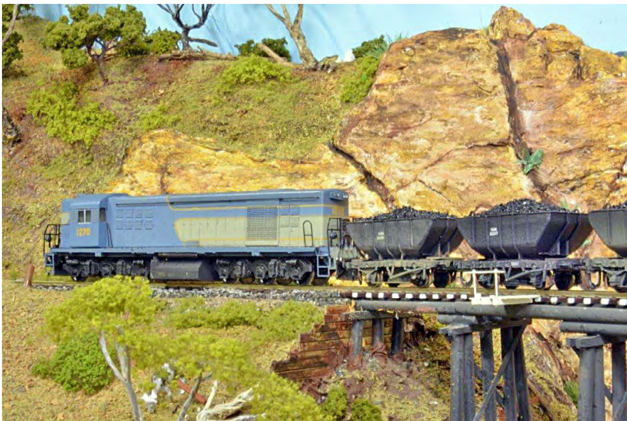
The VJM bodies (above) were scratch built from styrene sheet vacuum formed over a wooden block and detailed. The wooden hoppers (below) were scratch built with scribed siding. All are weighted to 23-25 grams.