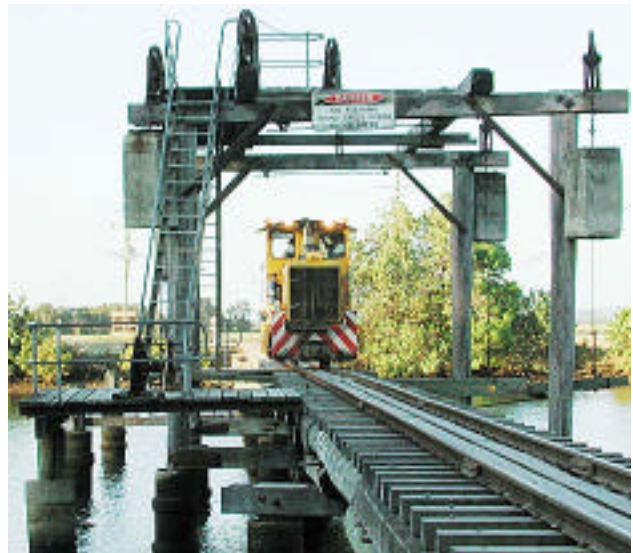
Bridge down for rail traffic.

The lift section drops onto solid timbers as rails are guided into place (see inset below). The harness is then disconnected from the lift section and raised back up into the top of the bridge structure to clear the top of locomotives.