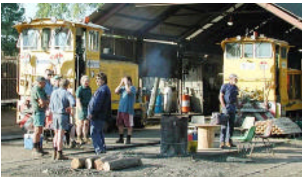
Shift change, 0700 hrs 26 Sep 03, at the Mill. Note the wood fire in the old oil drum and the pile of newly formed sprags (chocks) with turned handles.

Members of the LocoShed e-mail discussion group gathered at Nambour during the week of 22 Sep 03 to document the last year of Moreton Sugar Mill's tram line operation. The mill had been crushing for some weeks with weekend operation but this is expected to be the last year of operation for the mill.