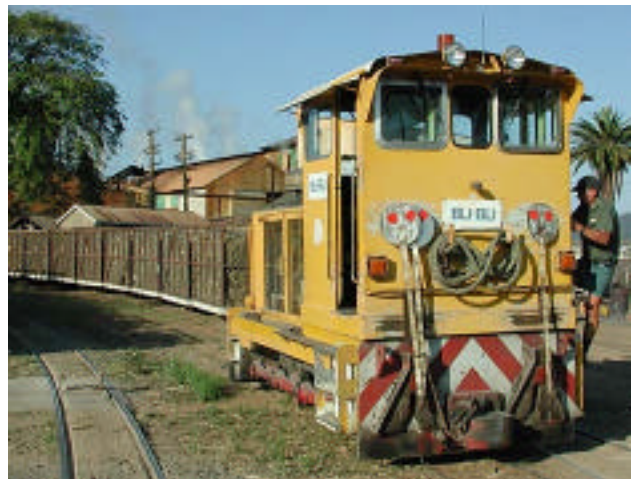
Locomotive Bli-Bli ready to depart for the day's work, 0720 hrs 26 Sep 03. Note the tow rope, end-of-rake markers, etc., as well as the warning lights.

On Friday 26 Sep 03 the group (individuals from NSW, SA and Qld) gathered at the River Depot for a final photo session and BBQ.