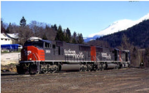
SP 9800 Dunsmuir, CA, 03/95