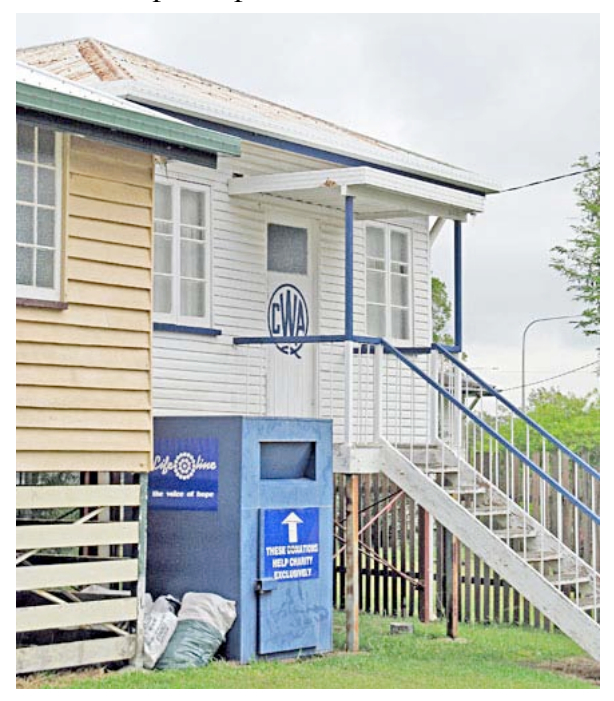
Front 3/4 views (above and below) showing small roof over entry, main hip roof, stumping and stairs. Originally the building likely had timber stumps and may have been closer to the ground.

Large towns and cities likely had room for dozens of women to stay for a few hours (breast feeding infants or waiting for the train, for example) or even overnight. A smaller town like The Caves would normally have a couple of private rooms, a