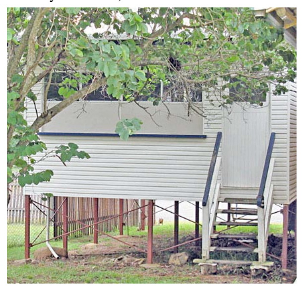
Rear view showing door offset from centre. The site slopes from the back to the front, thus the back stairs are lower than the front.

The building is now part of the community centre and has a passageway connecting it with the building next door. For scaling purposes, the front door opening is 31" x 79" (ie portion of the door that is visible, the door is likely 32" wide).