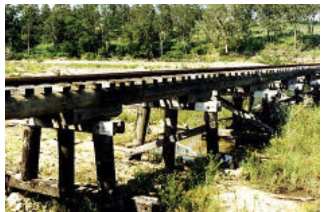
Cane line on ex-QR timber trestle (2 photos above).