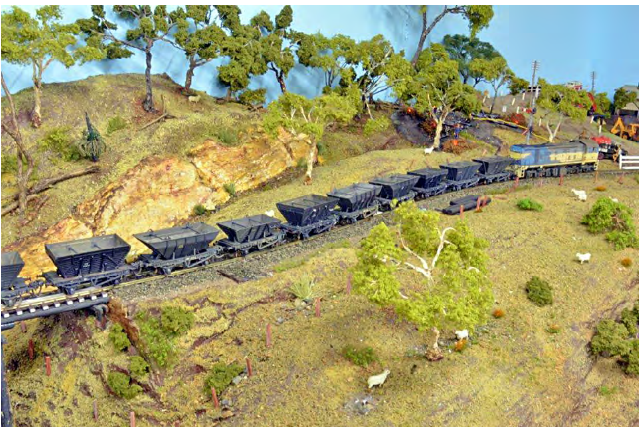
SWR train B 17 heading to the mines with empty 4w coal wagons (above) and returning loaded (below).