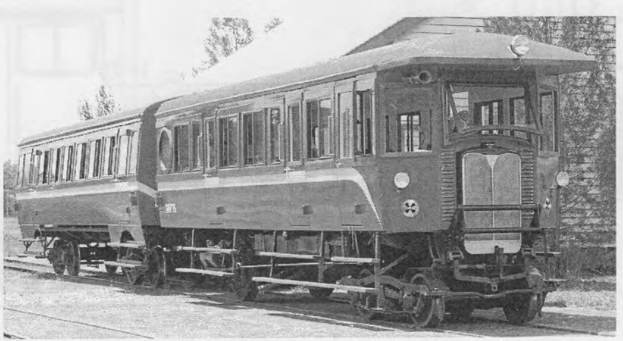
RM 76 and trailer - MVHR