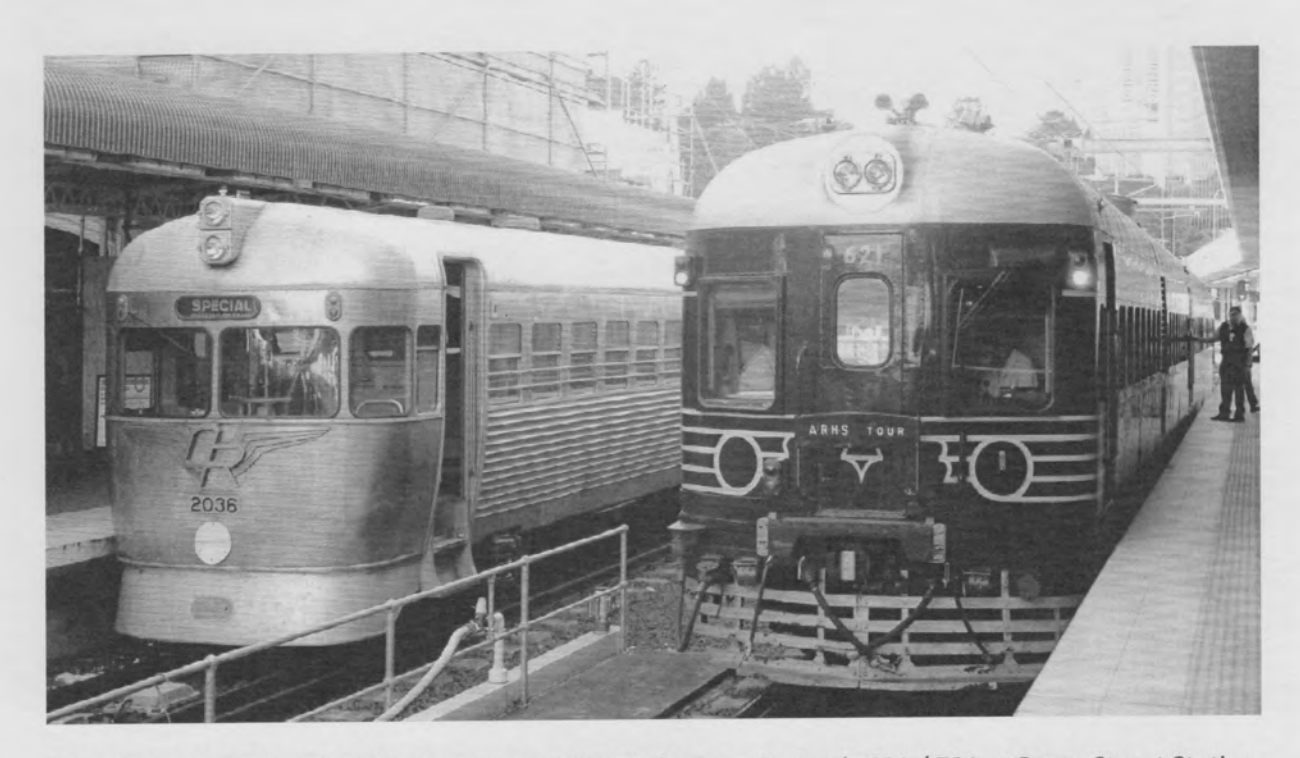
QR railmotors 2036 and 2034 sit alongside NSW Rail Motor Society's 621 / 721 at Roma Street Station – 17<sup>th</sup> June 2012