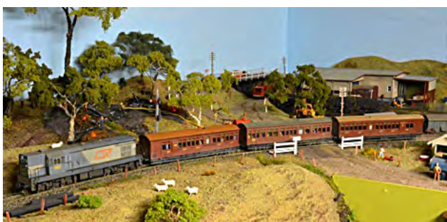
A great little train to model, we will more to say about this working in our presentation at the MRQC Convention in September.

The carriage set was stowed at Yandina overnight and weekends. During the day it was stowed at Nambour. The loco came off the overnight shunt from Mayne and returned back to Clapham/Mayne later in the afternoon on the south bound shunt.