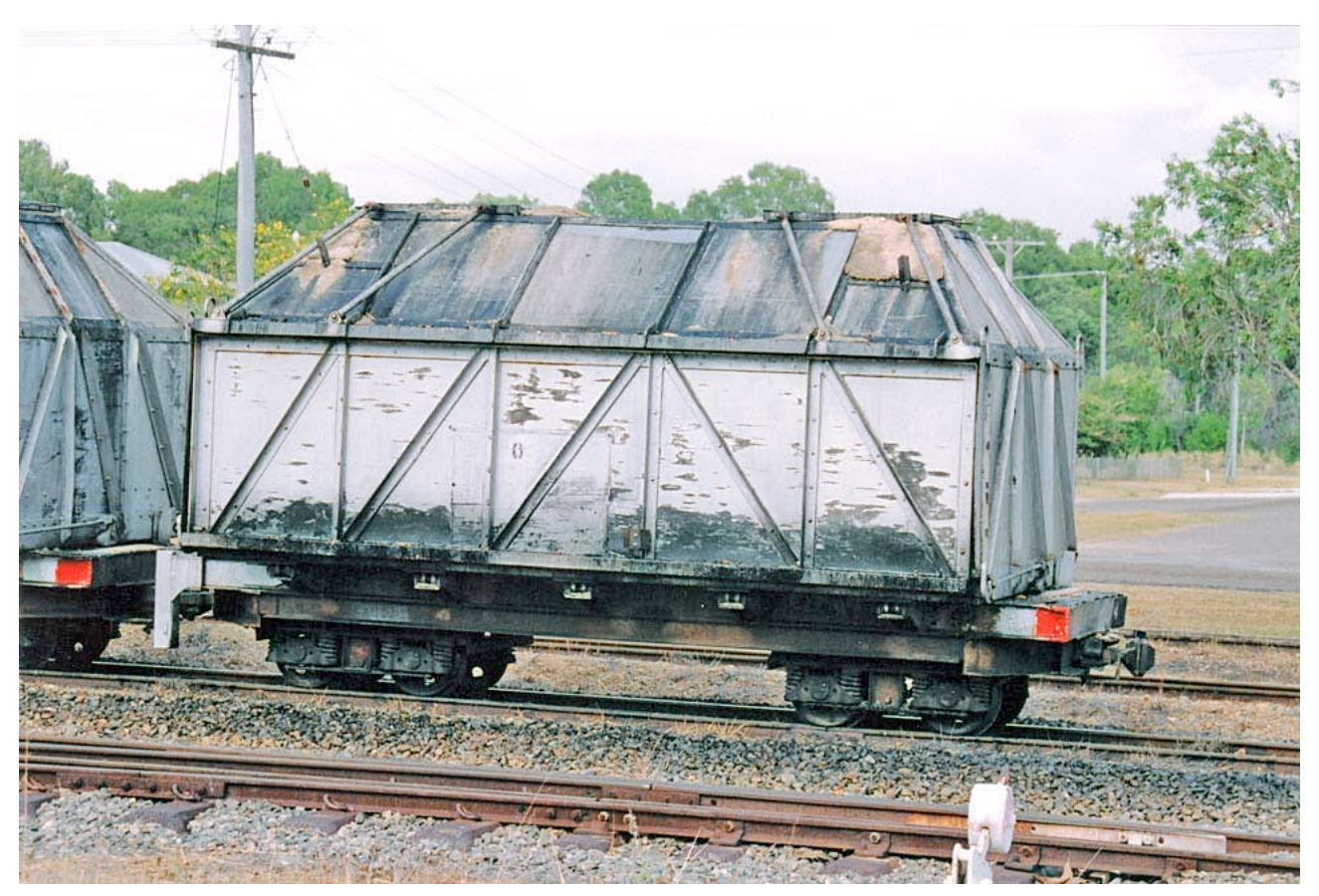
Bulk sugar boxes used by Victoria and Macknade Mills.