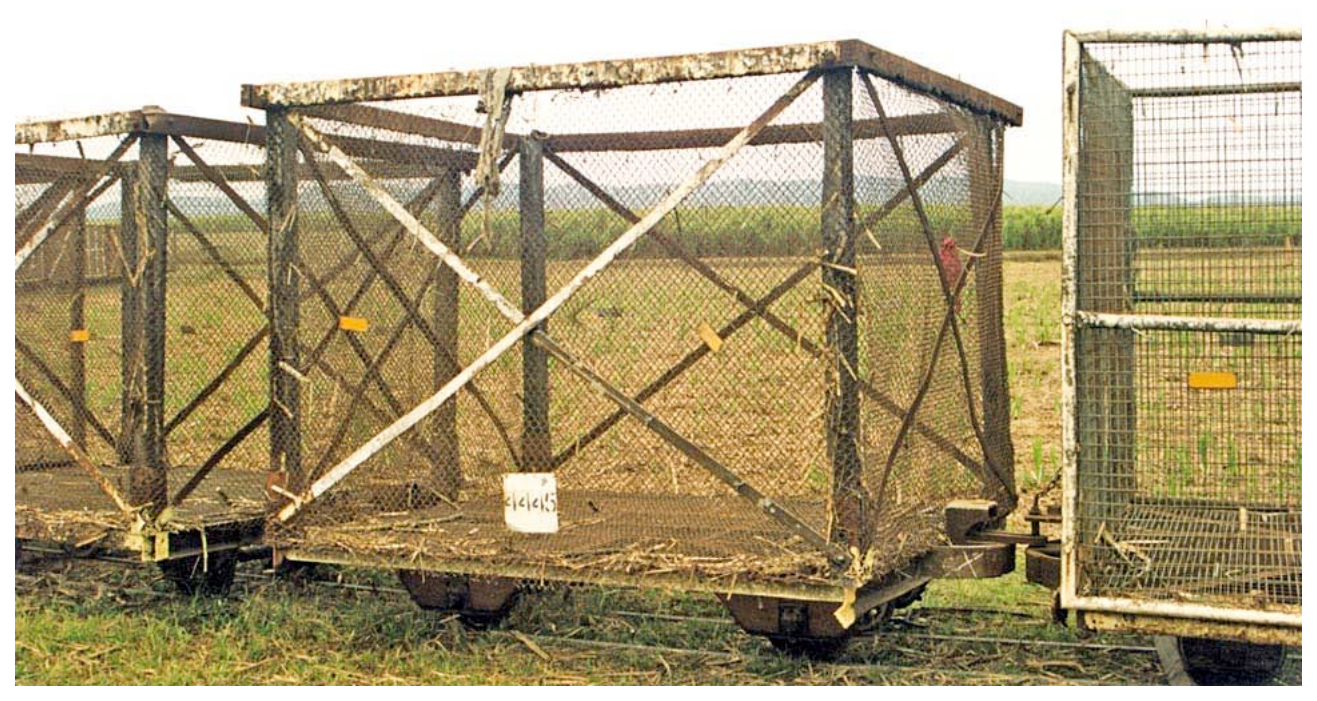
Early Mourilyan Mill cane 2.5 ton bin built on ex-wholestick truck frame