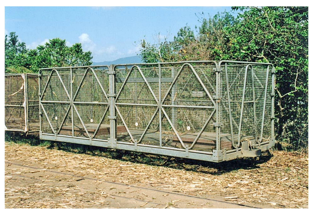
Mulgrave Mill 10 ton bin