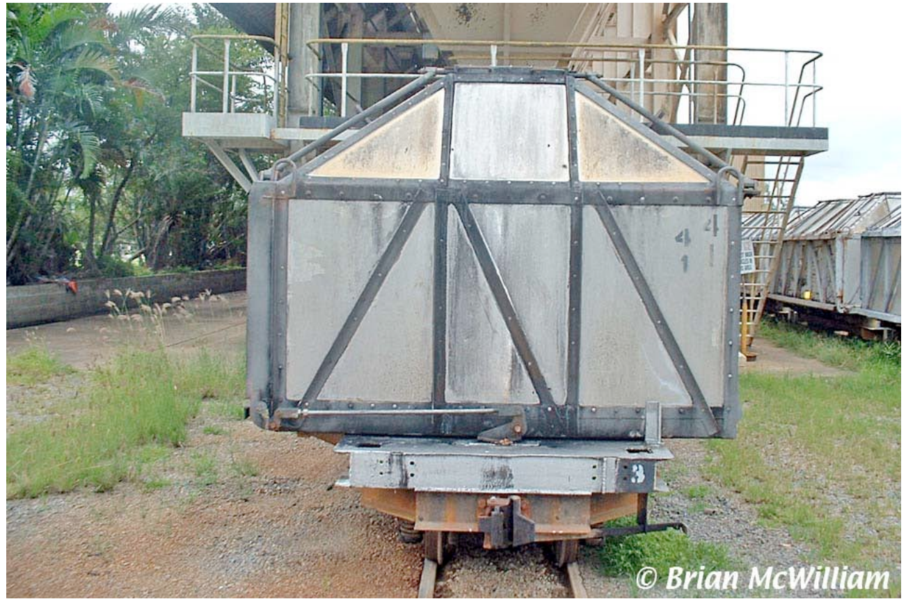
Herbert River Mills (Victoria and Macknade) bulk sugar wagons, end view.