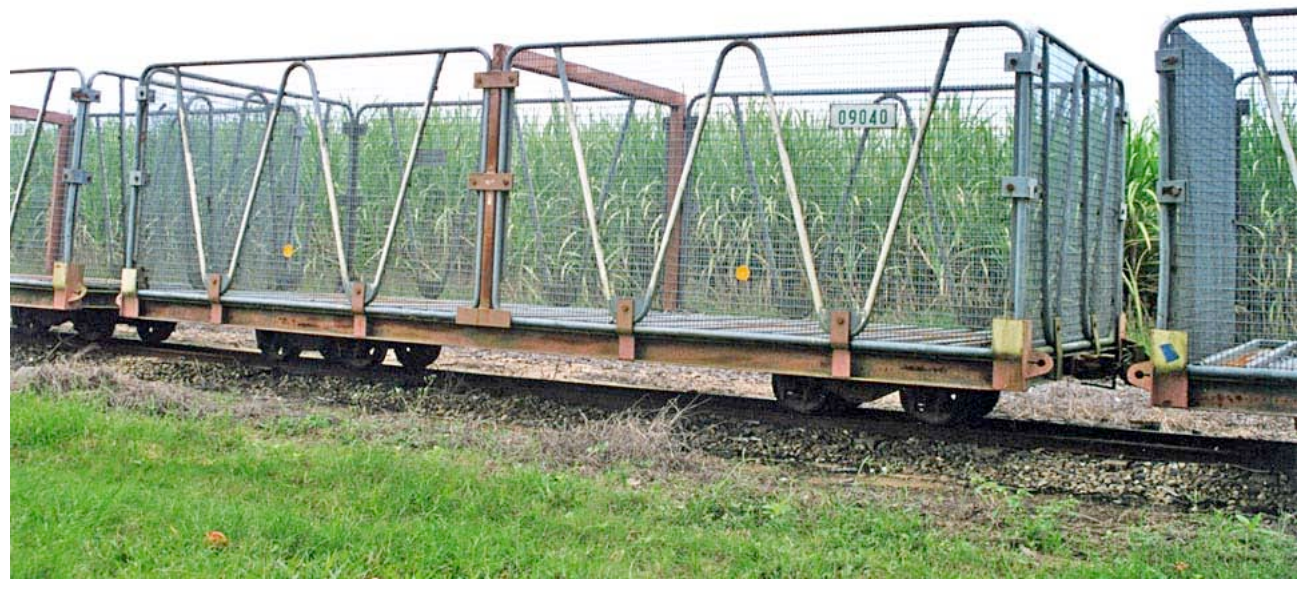
Victoria Mill 11 ton bogie bin