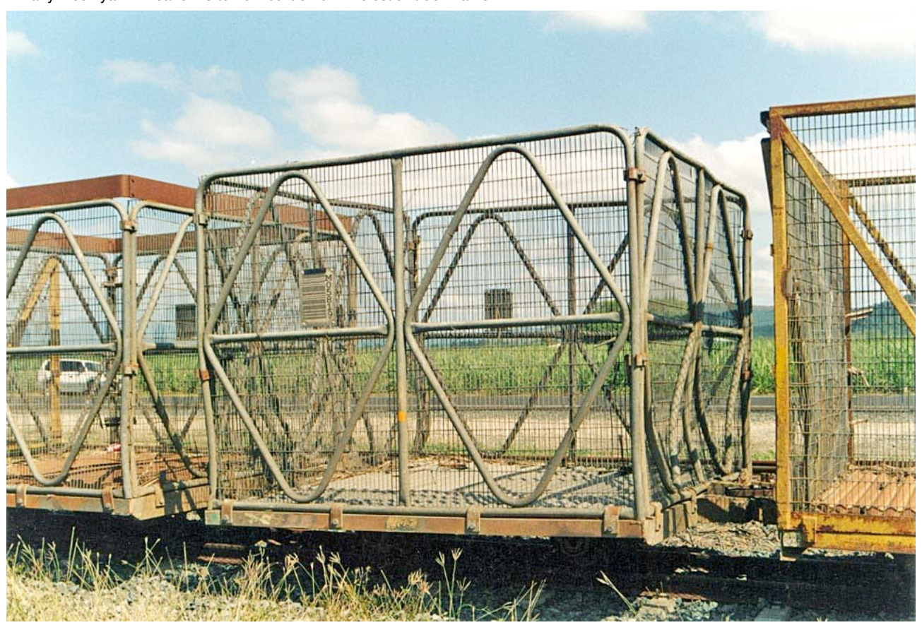
Marian Mill 4 ton bin; note extended sides on bin at left to increase capacity