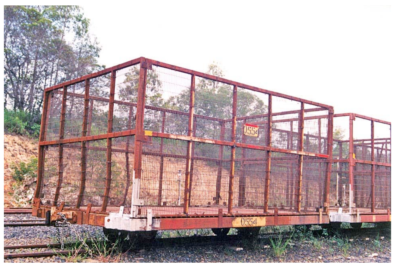
lisis Mill 6 ton bin