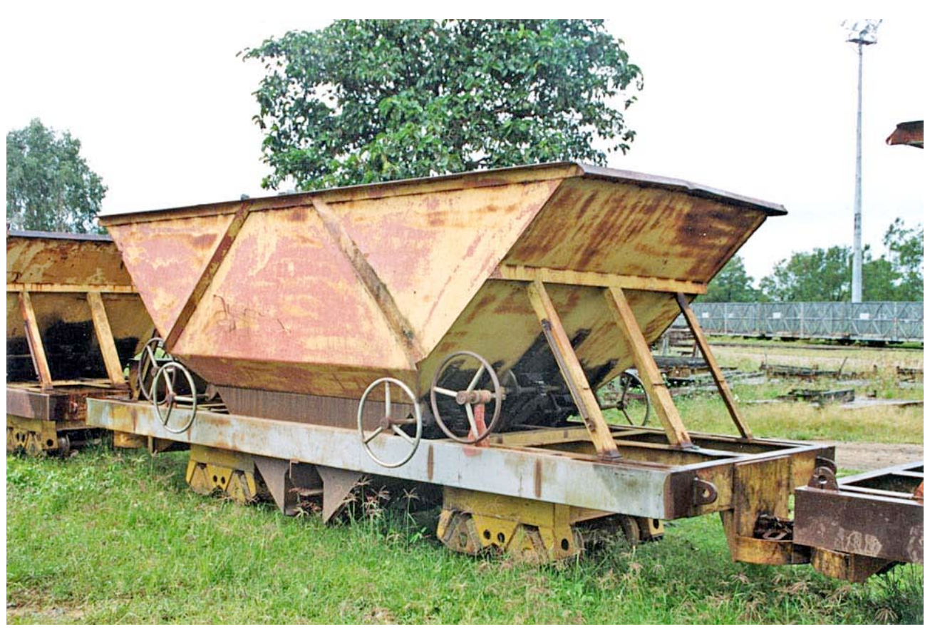
Bogie ballast hopper, Proserpine Mill

another. Some navvy wagons were even acquired from former non-sugar tramways, like the Burrinjuck Dam, Mapleton and Innisfail tramways. The photos only show a very small selection of navvy wagons that can be found.