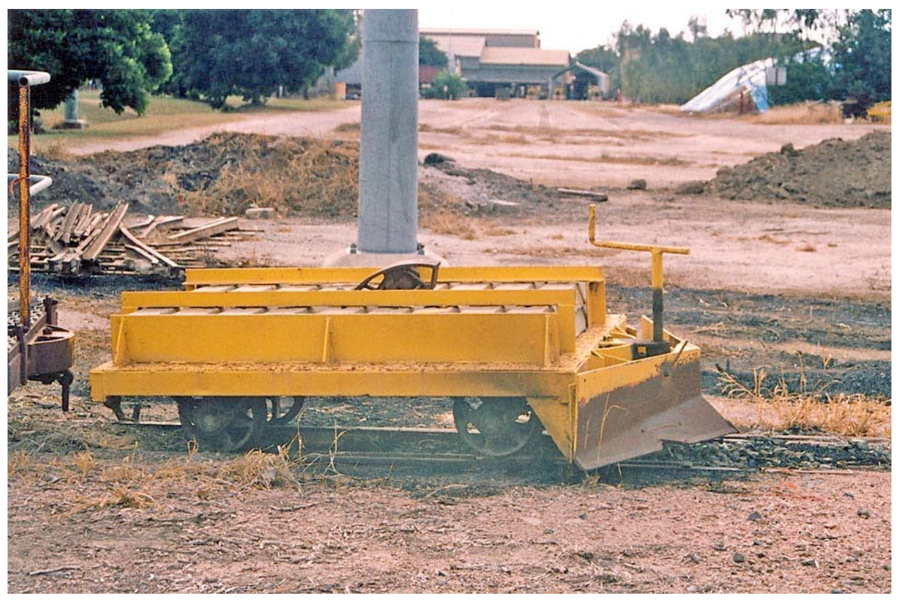
4 wheel ballast plow, Inkerman Mill