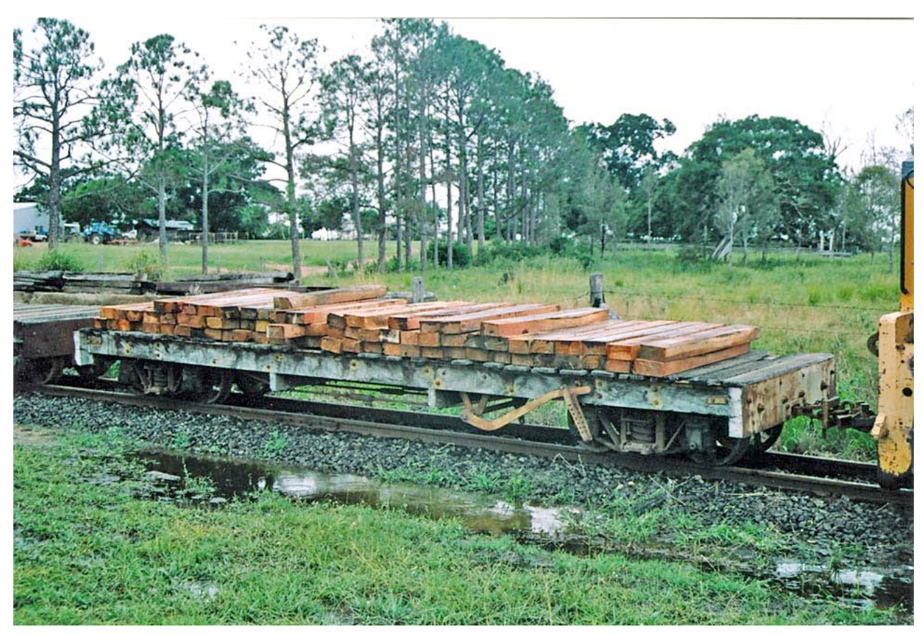
Bogie flat wagon ex-Burrinjuck Tramway, Fairymead Mil