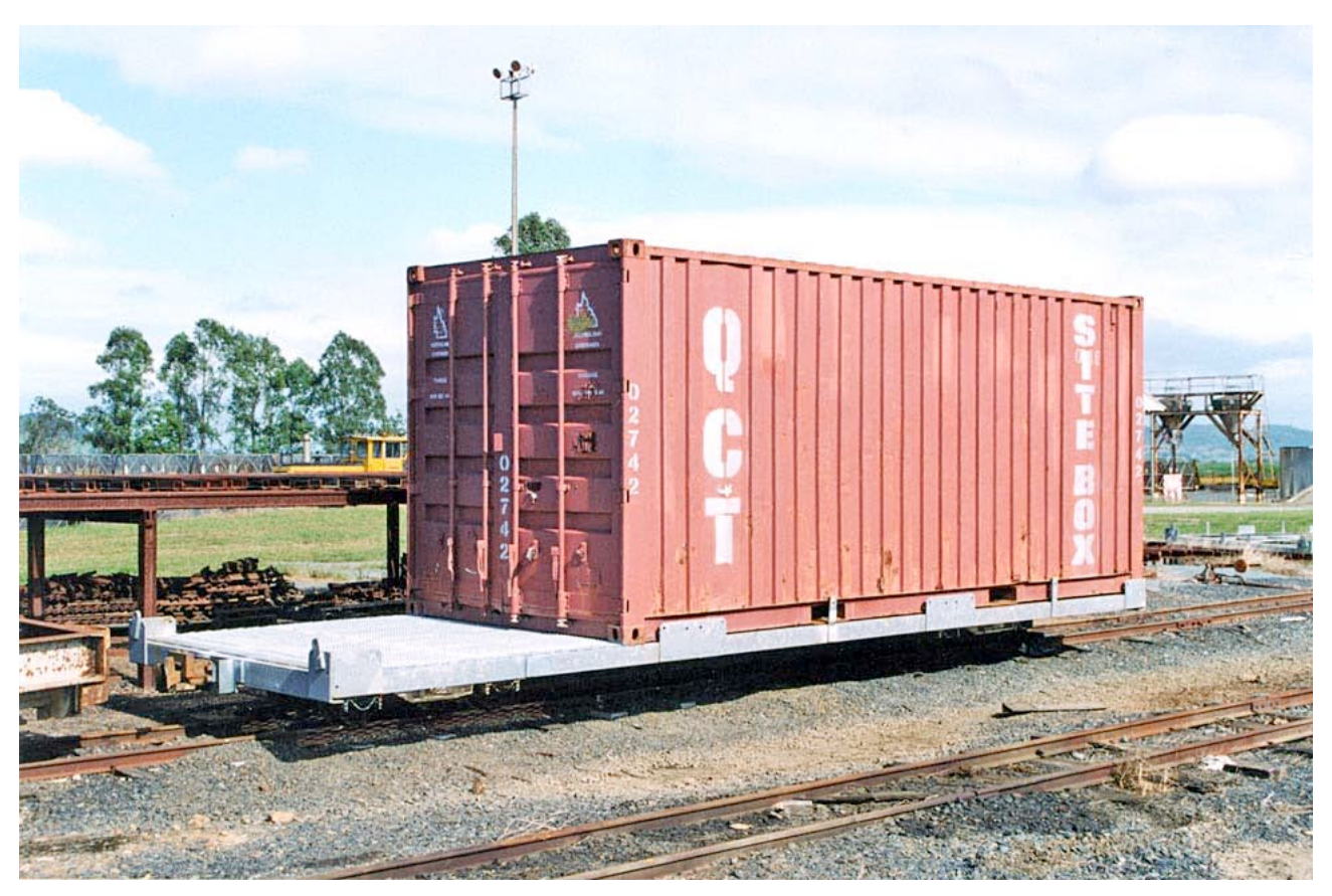
14 ton bogie cane bin frame fitted with a 20 foot container, Farleigh Mill